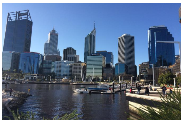
Down town Perth, with beautiful Elizabeth Quay in the foreground