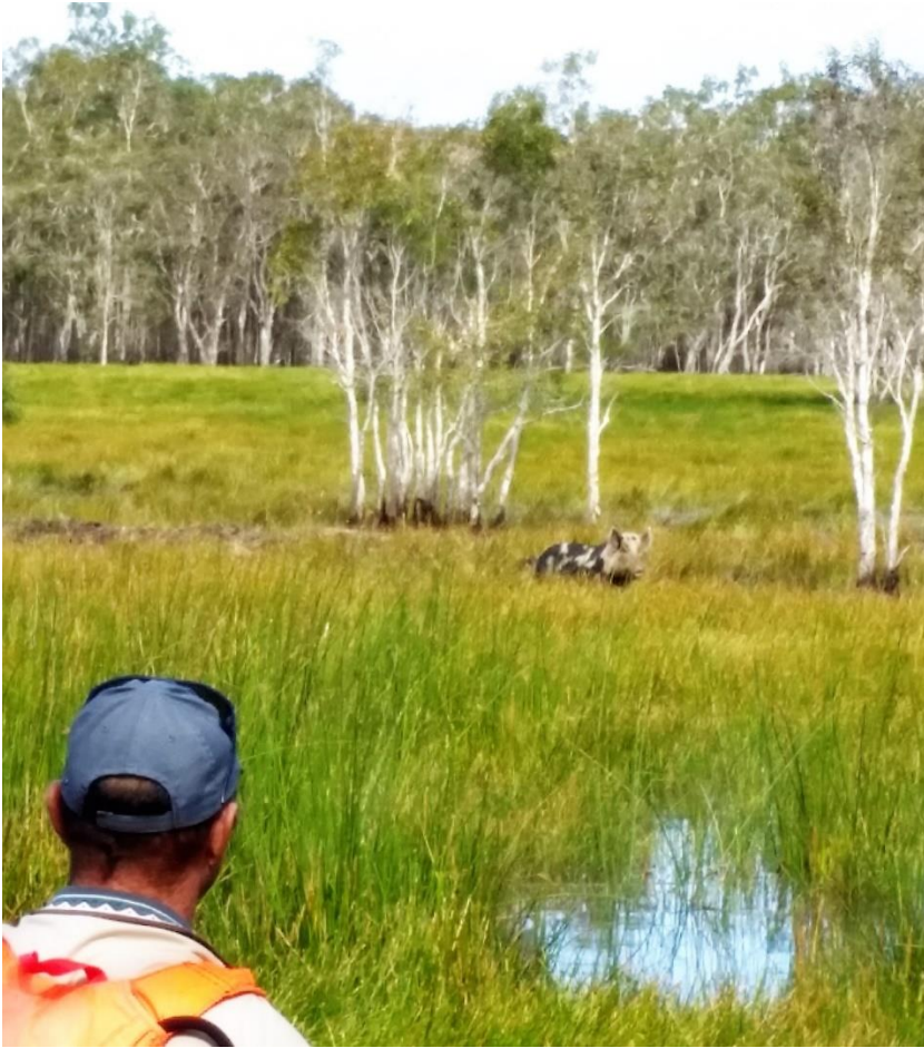
Feral pig in wetland before fencing complete