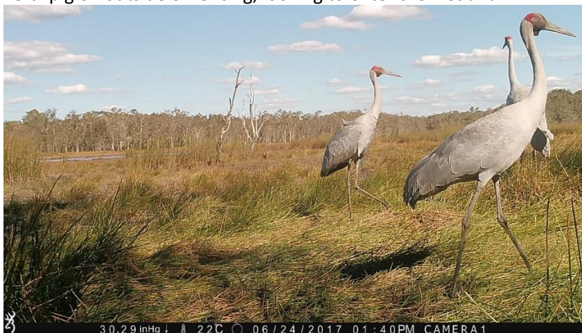
Native Brogula ( Antigone rubicunda ) using the fenced wetland