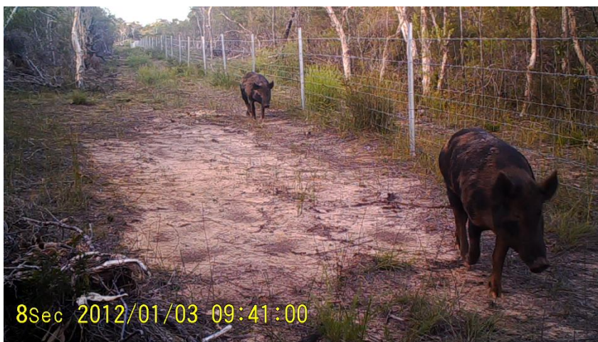
Feral pig on outside of fencing, looking to enter the wetland